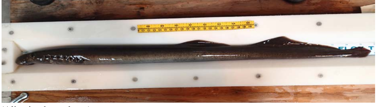
(Alive in photo above)